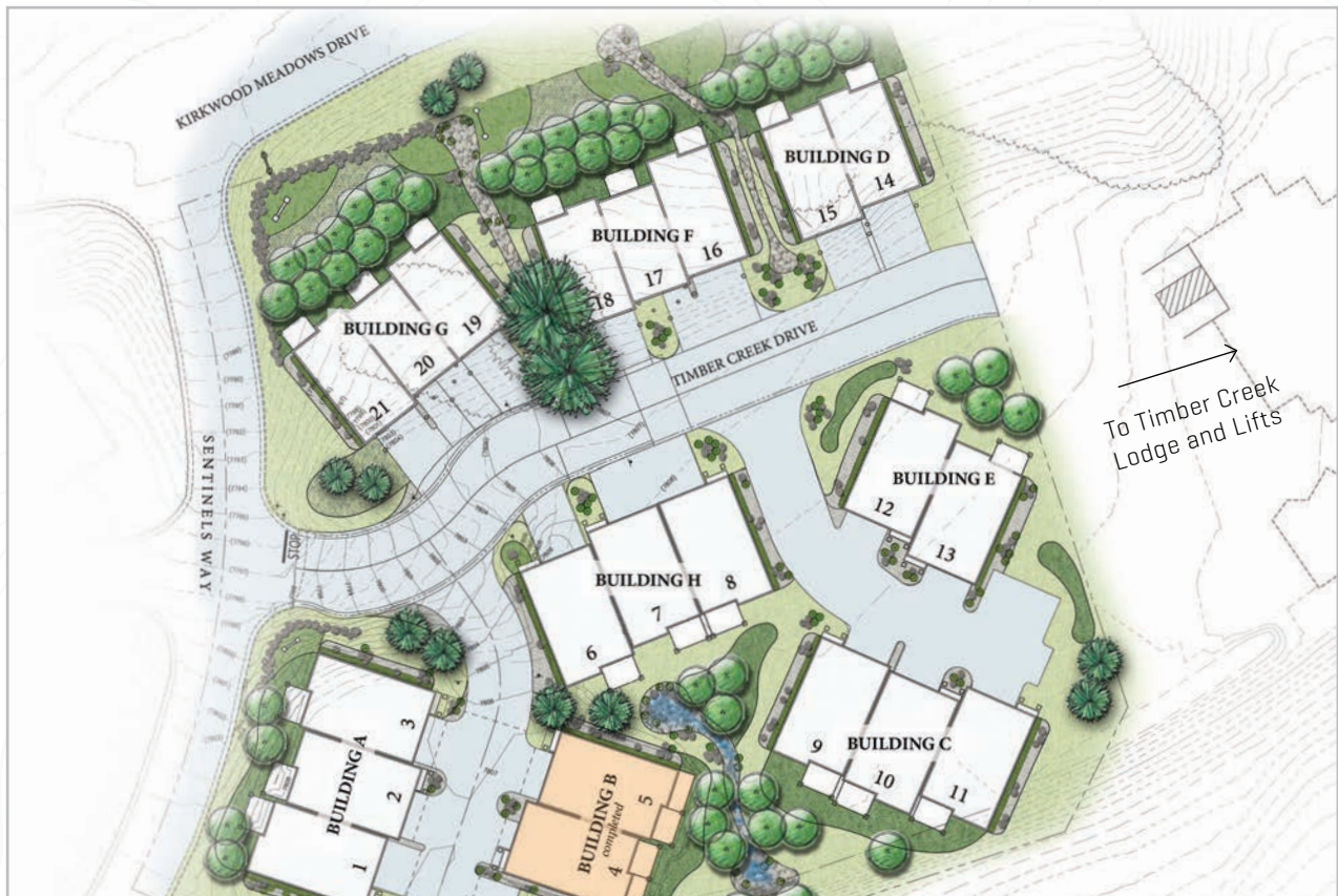
21 EXCLUSIVE, BEAUTIFUL TOWNHOMES